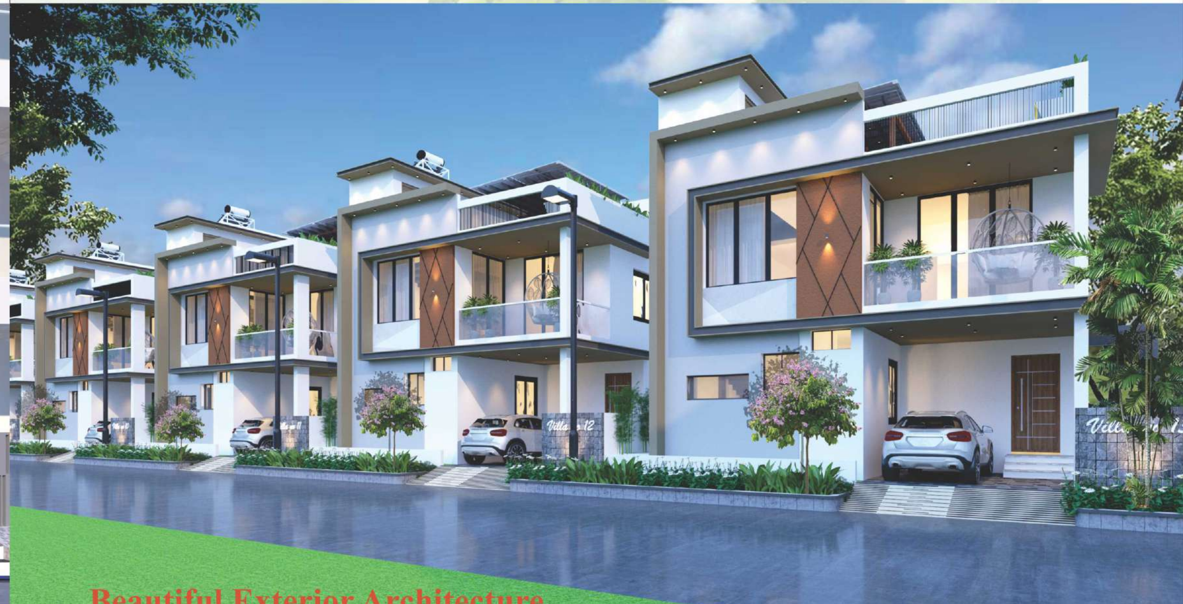
Beautiful Exterior Architecture