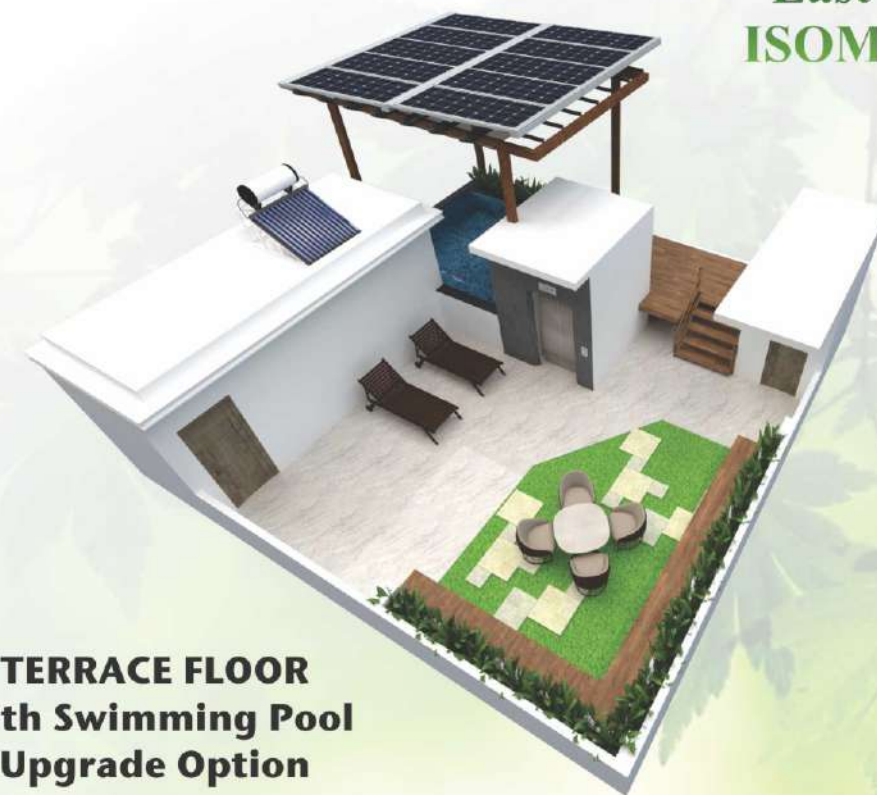
TERRACE FLOOR with Swimming Pool Upgrade Option