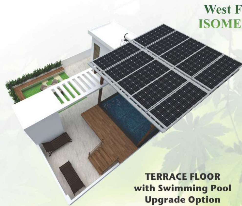
TERRACE FLOOR with Swimming Pool Upgrade Option